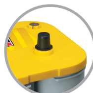
STD Standard Post