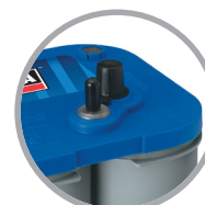
D/T Dual Terminal