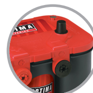
Side/STD Side Terminal & Standard Post